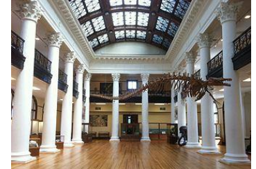
AL Museum of Natural History