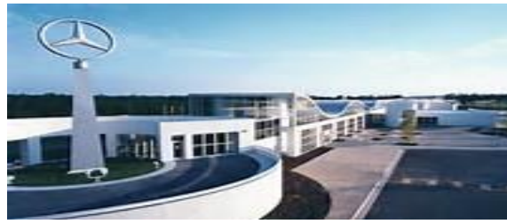
Mercedes Benz Plant