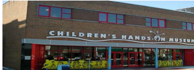
Children's Hands on Museum