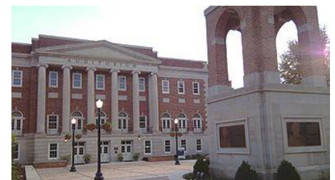
Foster Auditorium & Malone Hood Plaza