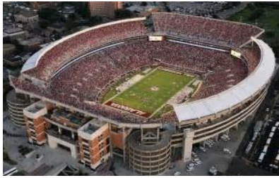
Bryant Denny Stadium