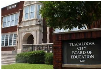
Tuscaloosa City Board of Education