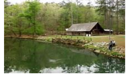
Tannehill State Park