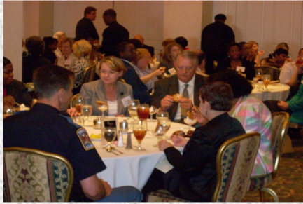
May Awards Luncheon in progress.