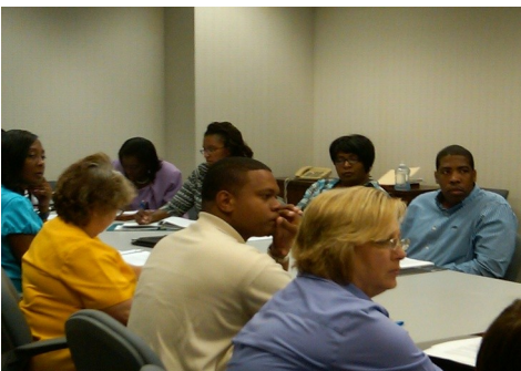
CGFM Exam study session in progress.