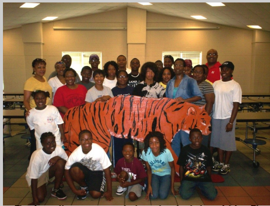
Thanks to all participants who lent a hand in helping McKee Elementary/Jr. High School get off to a clean start this school year.