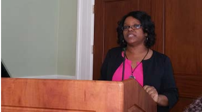
Gulf Region RVP Elect