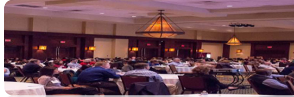
Fall PDT 2016