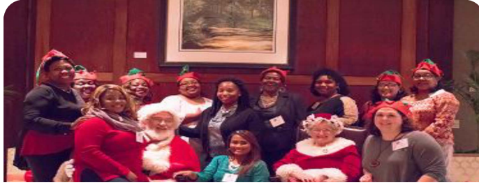
Toys for Tots Campaign with Santa and Mrs. Claus