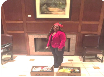
Food Bank and Toys for Tots